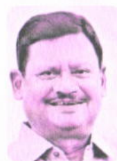
Hon'ble Shri Subhashbhou Dhote President of GSPM Member of Legislative Assembly, Rajura Constituency