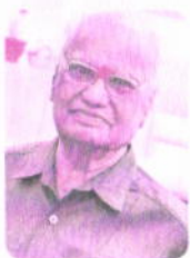
Hon'ble Adv. Shri Vitthalraoji Dhote Founder of GSPM Ex-Member of Legislative Assembly, Rajura Constituency