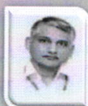
Key Note Speaker