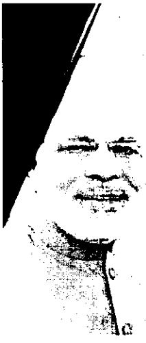
Shri Narendra Modi Prime Minister of India