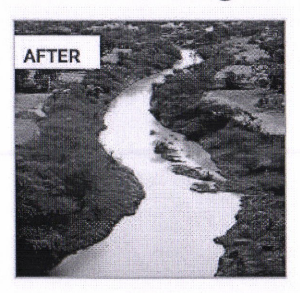
DRONE SHOTS OF NAGAV KHURD (AMALNER TALUKA)